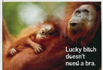
Lucky bitch doesn't need a bra.

All the others only have breasts that temporarily protrude after giving birth so they can feed their babies. The reason? According to some anthropologists, we evolved to have "decorative" twins to attract men, since they are a sign of fertility.